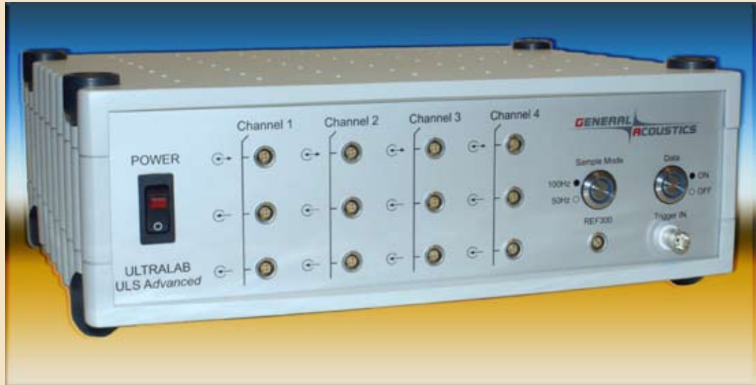
The UltraLab ULS Advanced Controller.

Sophisticated Level and Wave Measurements for Labs